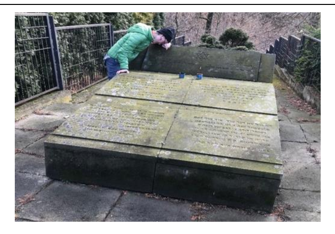
Figure 3: Tarnogród Memorial. Tarnogród, Poland

Sense of presence experiences occur without warning for living descendants of trauma, characterized by the sensing of non-living ancestors (Kidron, 2014). Most describe these experiences as comforting and note that basking in the deceased's company is meaningful in connecting to transgenerational trauma. Since grandchildren seek connection with Holocaust ancestors in areas of identity formation, life transitions, and meaning making (Kidron, 2014), sense of presence may offer clinical benefit in reconciliation of HTR (Steffen & Coyle, 2011). A related sense of presence ritual for Uitoto women is basket-weaving that includes "two baskets of memory" (Echeverri, 2012, as cited in Santamaría, 2017, p. 317), or the presence of historical consciousness and female resistance (Santamaría, 2017). Another touching moment of presence is the fluid dialogue and poem of an African great granddaughter, wherein she senses her great grandmother near and converses with her through poetry (Henderson, 2021).